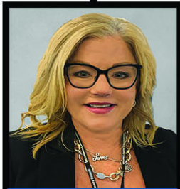
COUNTY COUNSEL TRACIE LEE INTERIM